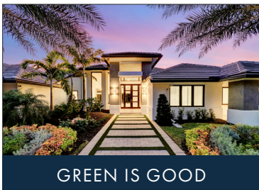
GREEN IS GOOD

We understand the impact and role of technology in our daily lives. And we believe in minimizing our impact on Mother Earth. Every home we build is constructed with maximum efficiency in mind—with green features that benefit Mother Nature as well; Like high Seer A/C, spray foam insulation, full LED lighting. Our properties also feature a state-of-the-art air filtration system from Solaris that purifies and cleans the air within your home. The in-duct Solaris Whole House Air Purifier contains the latest UV light technology that kills bacteria, viruses, mold, pollen, and other airborne particles before cycling clean air back into your home. Our interior spaces are purposeful and functional. Materials are top-of-the-line. Build quality is on point. Plus, Hassle-free automation, like the Control4 Smart Home system, allows our offerings to stand out from the crowd, and provides a simple, easy-to-use solution for managing and checking the status of common household tasks like lighting and security.